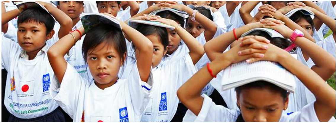
Tsunamis can occur anytime. Tsunami-prone schools need to be ready to evacuate all of their students to safety when tsunamis strike during school hours.