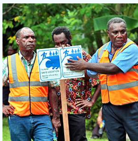
Officials explain the evacuation signages in local language.