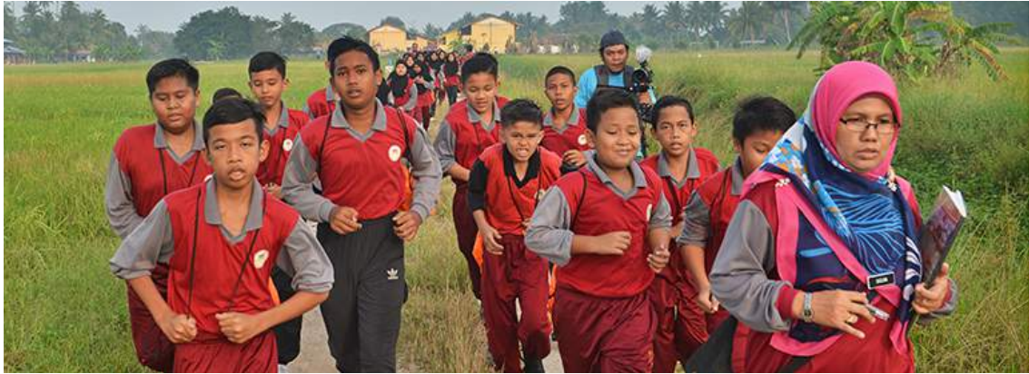
A tsunami warning requires the entire community to evacuate. School preparedness is more effective if the emergency plans are harmonized with those of local governments and surrounding communities.