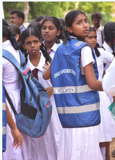
Teachers should become more sensitive in order to support their students after a tsunami event.

In order to support their students after a tsunami event, teachers should become more sensitive to changes in their students' language or behaviours 72 .