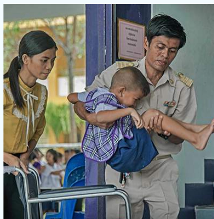
Preparedness plans ensure every students' safe evacuation.

This mapping exercise can guide the making and placing of tsunami warning signs for the community in the local language which highlight 54 :