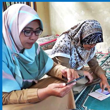
Using STEP-A, teachers can evaluate changes in students' knowledge and attitudes towards tsunamis.