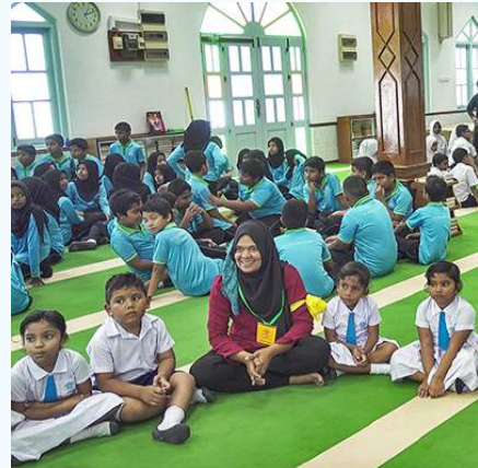
In the Maldives, the mosque was identified as the safe areas.