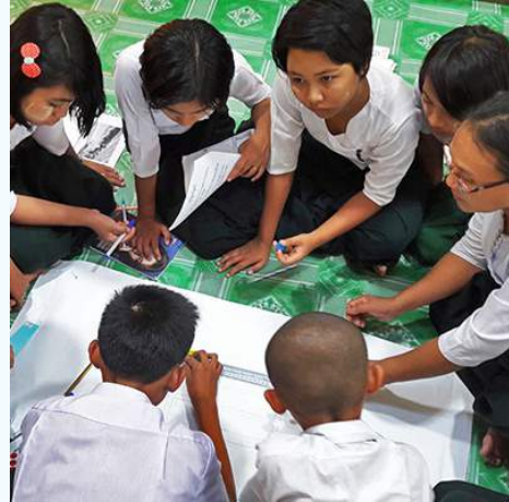
Students can play an active role in mapping safe and dangerous areas around the school.

In the event that a school may not be safe to return to, the evacuated staff and students will be taken to temporary evacuation shelters.