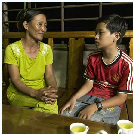
Parents were invited to observe the drills.