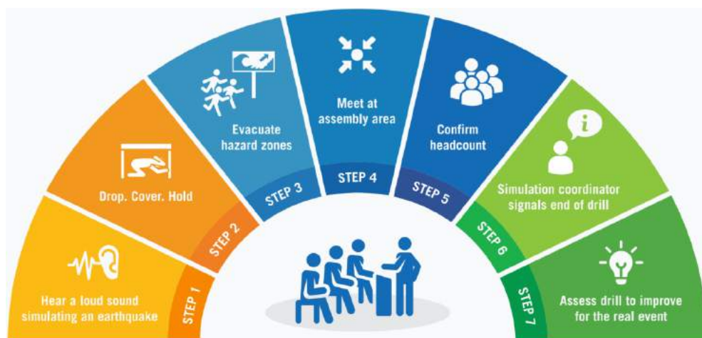
Figure 1: Seven Steps of a Tsunami Drill

Under the project, this was the minimum time that schools required in the event of a local tsunami 5 . In this chapter, reference has been made to Committees and Task Teams that schools should establish to strengthen preparedness. The composition of the teams and functions are described in chapter 3. These are indicative and based on the expert technical reports reviewed, as well as actual teams that were set up to manage the evacuation drills under the project. It is up to the schools to decide how to constitute teams that are required to fulfil the tasks defined in chapters 2 and 3 6 .