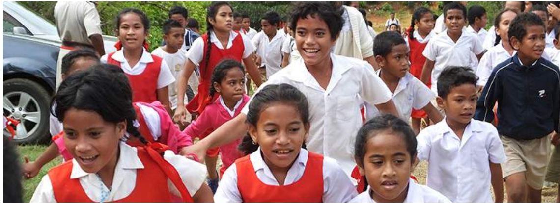
Safety drills in schools create lots of excitement among students and communities. Most importantly, the drills help to prepare students and their families for natural hazards like tsunamis.