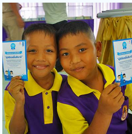
All participants of school drills in Thailand were awarded with a certificate that displayed key tsunami safety messages.