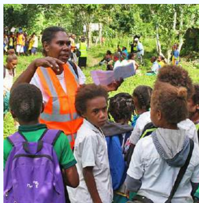
Teachers take a headcount in the safe area.