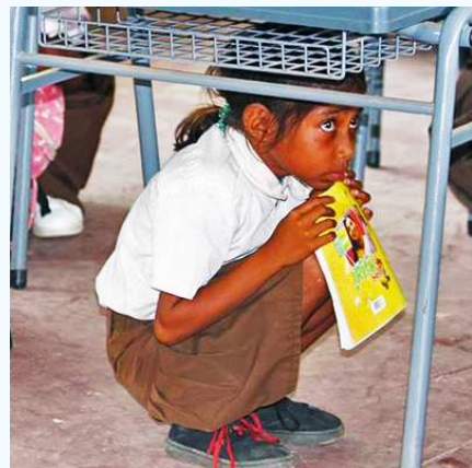
Students taking cover under the table.

Teachers make sure that children move away from windows, glass, doorways, and unfastened furniture. Teachers ensure the classroom door remains open in order to prevent their students from being locked inside the classroom due to falling debris during an earthquake. Teachers then also “Drop, Cover, Hold” themselves while continuing to remain alert and monitor their students during the earthquake. Students and teachers Hold until the siren stops during a drill.